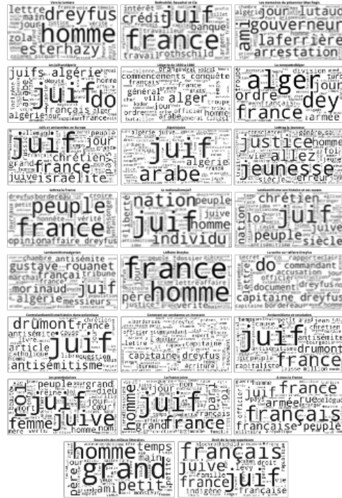
Figure 2 Wordclouds.